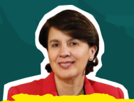
Rosalia Arteaga Former President and Vice President of the Republic of Ecuador, Independent