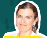
Mateja Vodeb Ghosh Ambassador, Embassy of Slovenia in India