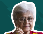
Kamla Bhasin Writer, Poet, Social Scientist, Independent