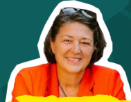
Violeta Bulc Curator of Ecocivilisation, Former Commissioner for Transport, European Commission and Former Deputy Prime Minister of Slovenia