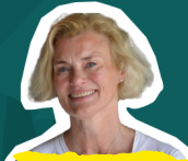
May-Elin Stener Ambassador, Royal Norwegian Embassy in India