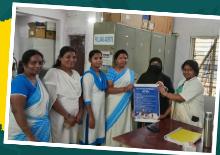
From ideas to action: posters made by Changemakers now in PHCs.