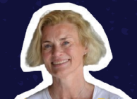
May-Elin Stener Ambassador, Royal Norwegian Embassy in India