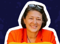
Violeta Bulc Curator of Ecocivilisation, Former Commissioner for Transport, European Commission and Former Deputy Prime Minister of Slovenia