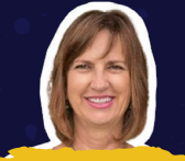
Susan Ferguson UN Women Representative for India, UN Women