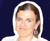
Mateja Vodeb Ghosh Ambassador, Embassy of Slovenia in India