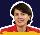
Rosalía Arteaga Former President and Vice President of the Republic of Ecuador, Independent