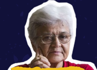
Kamla Bhasin Writer, Poet, Social Scientist, Independent